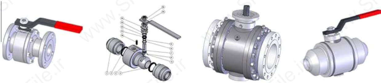
Fig. 2. Design examples.